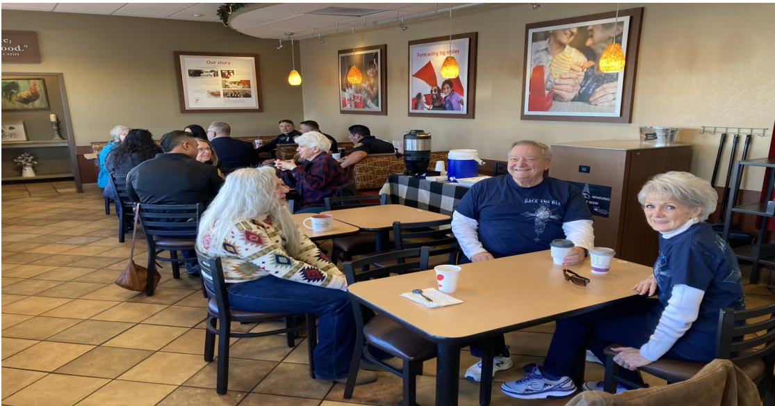
Coffee with a Cop at the Chick-Fil-A 3801 Ellison NW